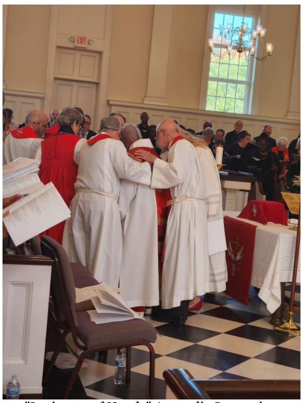
"Laying on of Hands" Apostolic Succession