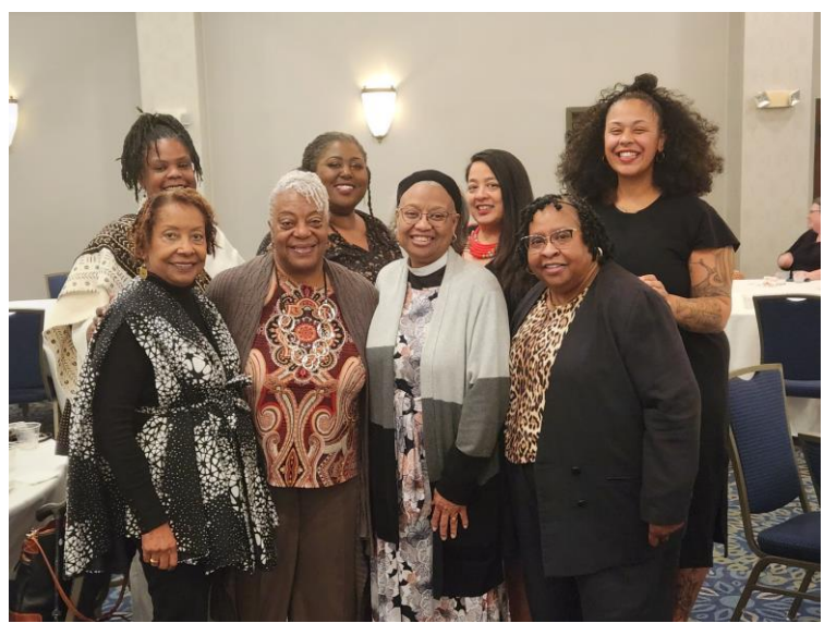
"Wakanda" Synod, a fellowship of people of color in the ELCA

On Friday evening, a reception was given by the "Wakanda" Synod; this is an unofficial synod, a fellowship of people of color in the ELCA. The fellowship and food were "delicious"!