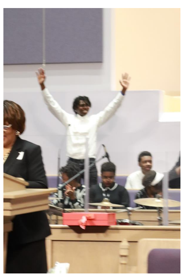
Member of the Booker T. Washington High School Choir & Macedonia Christian United Church of Christ